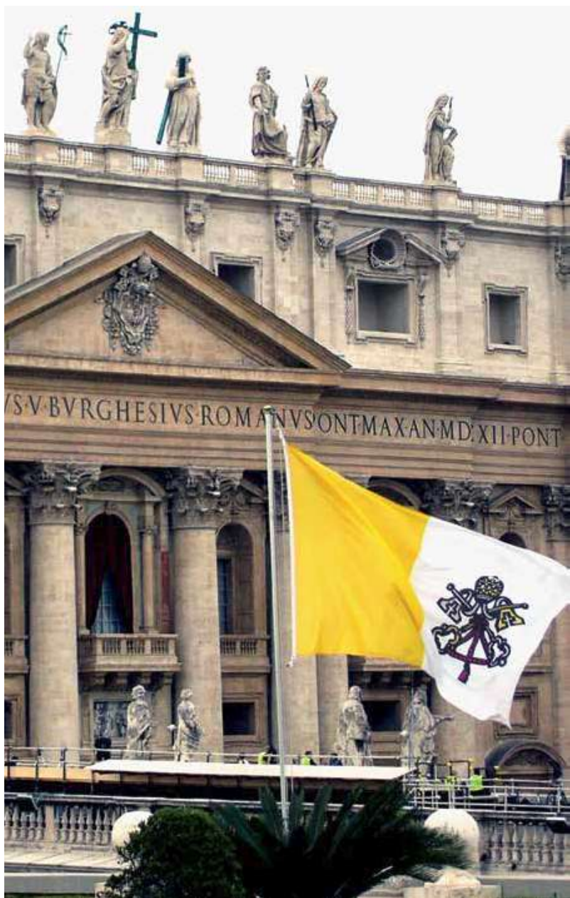
Figure 0.1. St. Peter's Basilica & the Vatican Flag, Residenza Paulo VI, 2005 (Extraterritorial Zone)